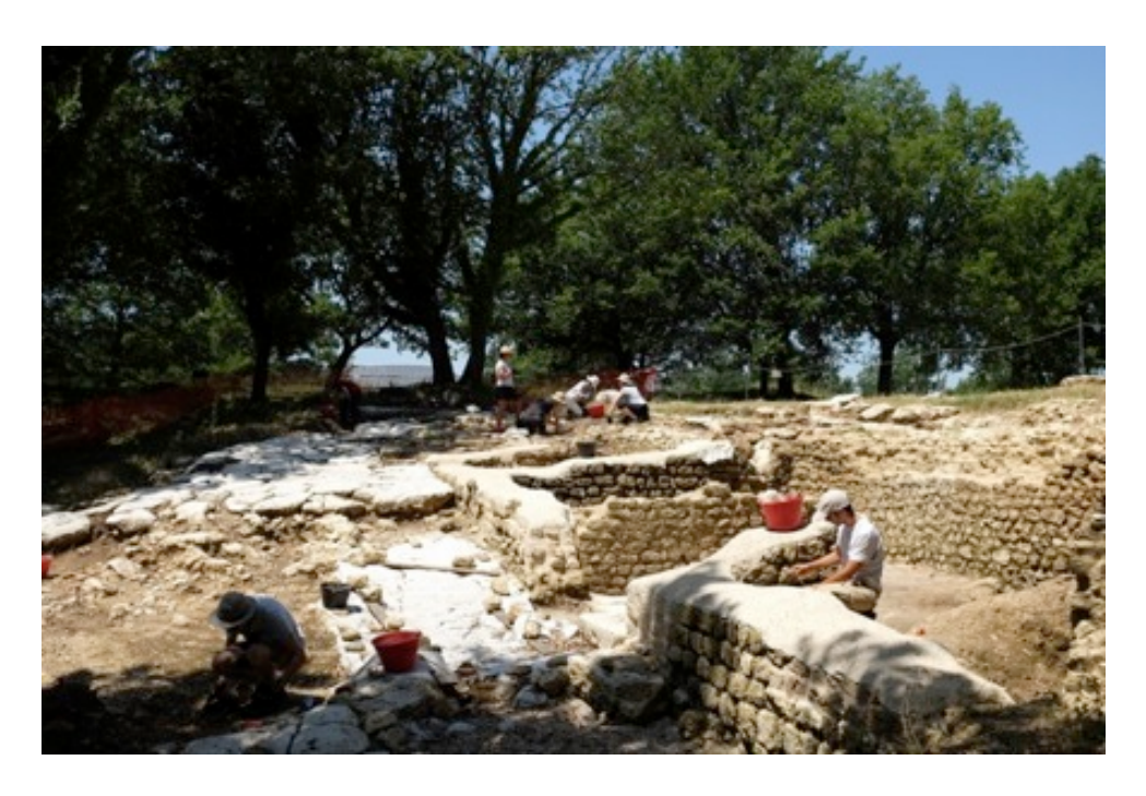
The ACAP excavation site at the ancient Roman town of Carsulae

Macquarie University students will also take part in the second 2016 ACAP season, 'Ceramic Analysis', which runs during the mid-session break from 19th September to 14th October. The course, part of AHIS 392 ('Cultural Heritage'), will be undertaken by three Participation and Community Engagement (PACE) intern students, who will assist in the investigation of pottery from the site. They will be instructed in the documentation, illustration, photography, and analysis of the large assemblage of pottery recovered from Saggio D, which forms part of the site's tangible cultural heritage.